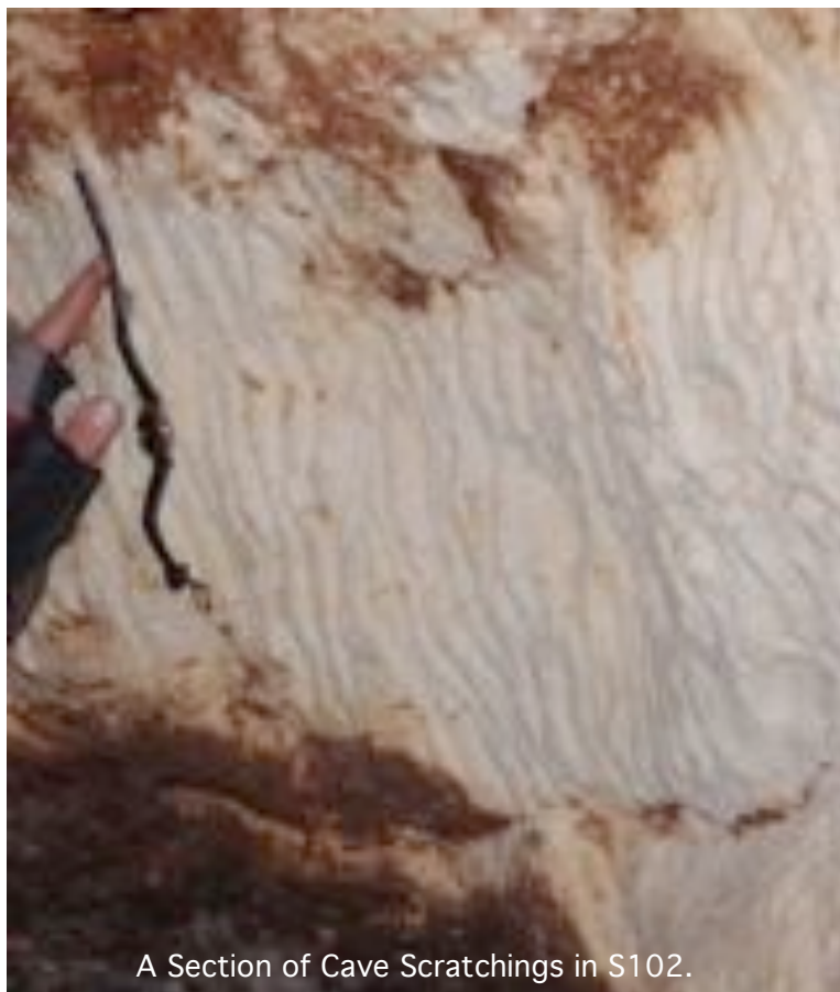
A Section of Cave Scratchings in S102.

I was given the opportunity to lead the crew out of the cave and was successful! The climb up the ladder may have been both the worst and most rewarding experience of the day because of the immense difficulty I had using my entire body strength to pull myself out of this hole. I'm proud that I was able to do it and felt like a hardcore caver!