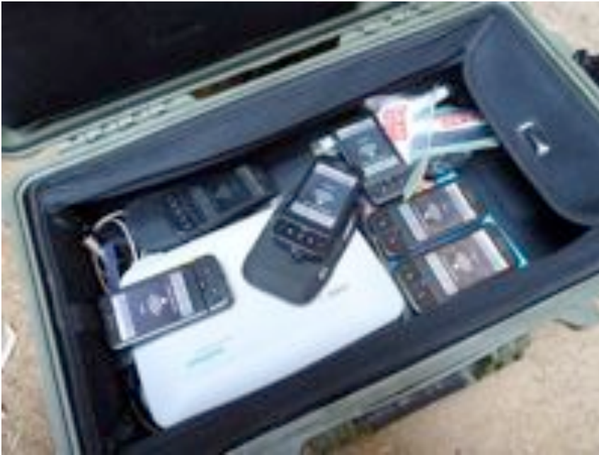
At left: The mesh telephone network.

We had some of the FUSSI people stand as far in the cave as they could without losing line of sight, and then I talked to them via Mesh Potato and then BatPhone. We used a 30m line to make sure we were getting the theoretical range. In fact, even with a low rise in the floor partially obstructing things, we got at least 40m, and couldn't test any longer in a straight line without me being outside the cave.