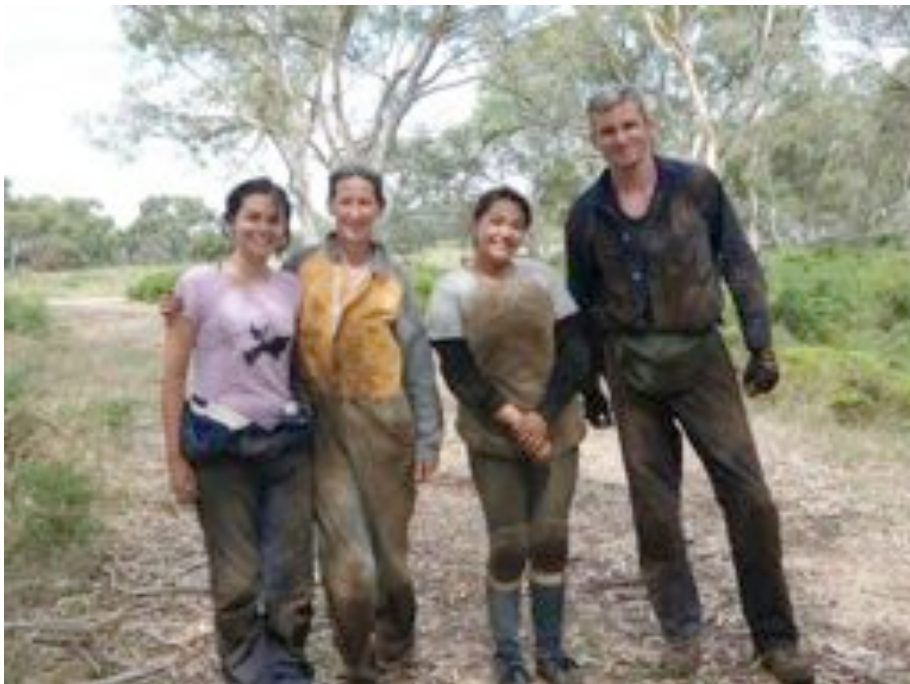
The Latte Set!

I just walked up the cliff with only one shoe. However, it was well worth it, as we had confirmed that the theoretical predictions about WiFi propagation underground were more or less reasonable, and indeed we had managed to setup a chain of BatPhones to allow us to call almost 100m underground. If we had the satellite link integrated we could have called across the world, or at least to the nearest pizza bar for lunch.