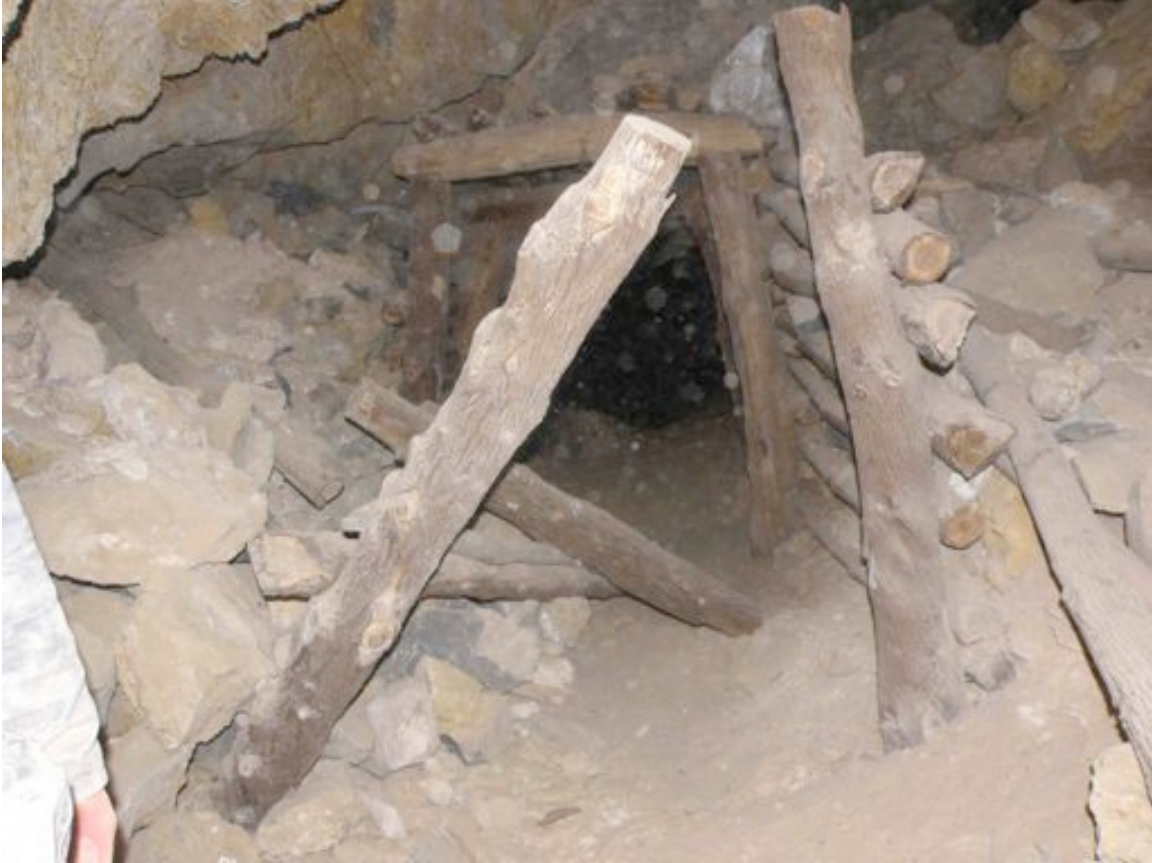
The Rock and Stanchion Collapse in Clara St Dora

There was a collapse of some stanchions in Clara St Dora cave last weekend when one of our party lent on one of them. Some discussions are occurring between FUSSI and CEGSA as to what to do about it. The collapse has partly obstructed the track into the cave near the gate. Further, the gate itself has been actively bypassed by some enterprising bodies. FUSSI members will be returning to the area with a couple of bags of cement to plug the bypass and no doubt move a few of the rocks out of the way from the collapse! The entrance to Clara St