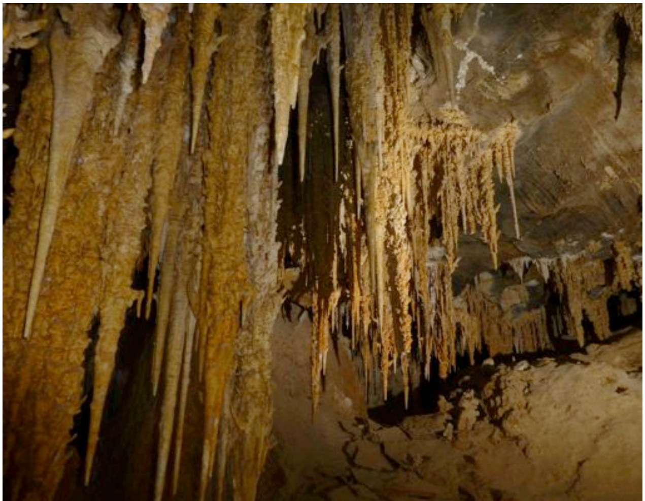
Some Pretty Things in Clara St Dora, Cave.