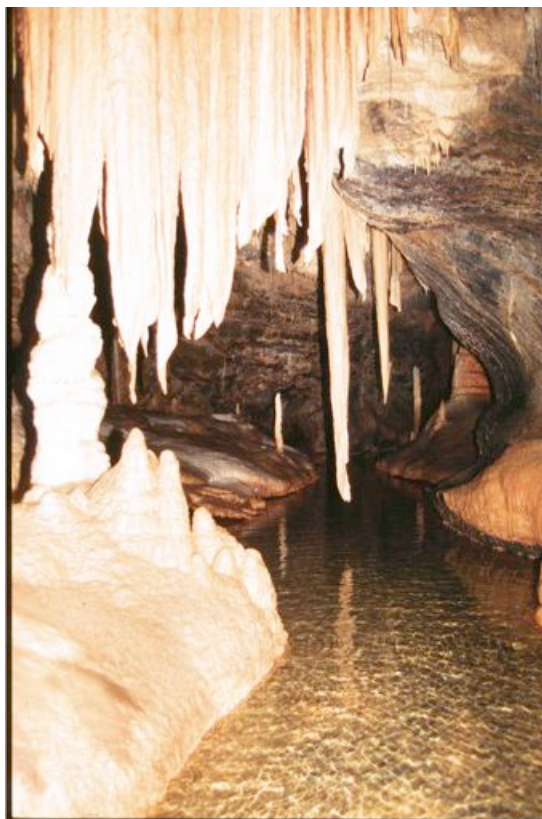
The Streamway Passage of Croesus Cave. Mole Ck, Tasmania.

There was much groaning, thoughts of washing hair, mowing the lawn etc.