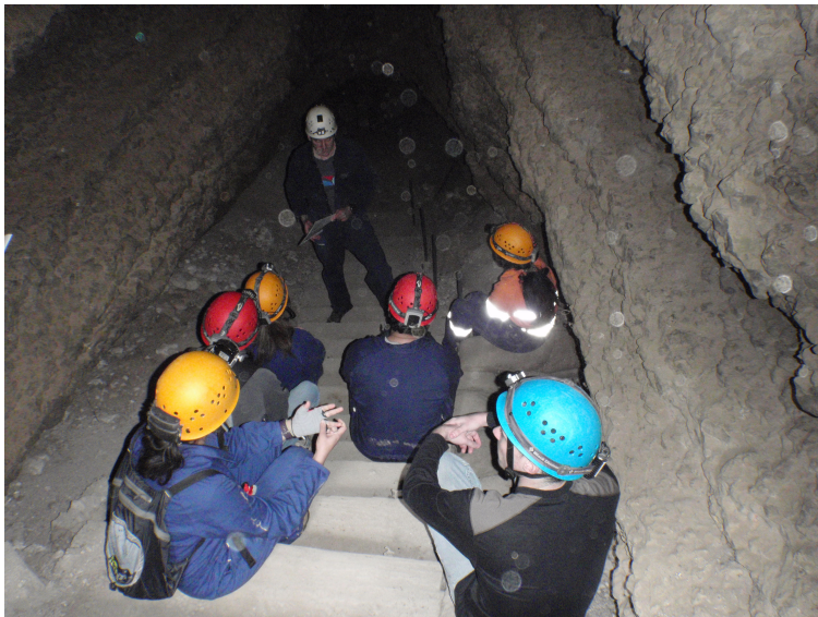
On the Steps at Cora Lynn Cave

I heard about the trip via the FUSSI Facebook page. The fact that it was a one-day trip on a Saturday appealed to me, and the fact that it was said to be for all levels of cavers. The